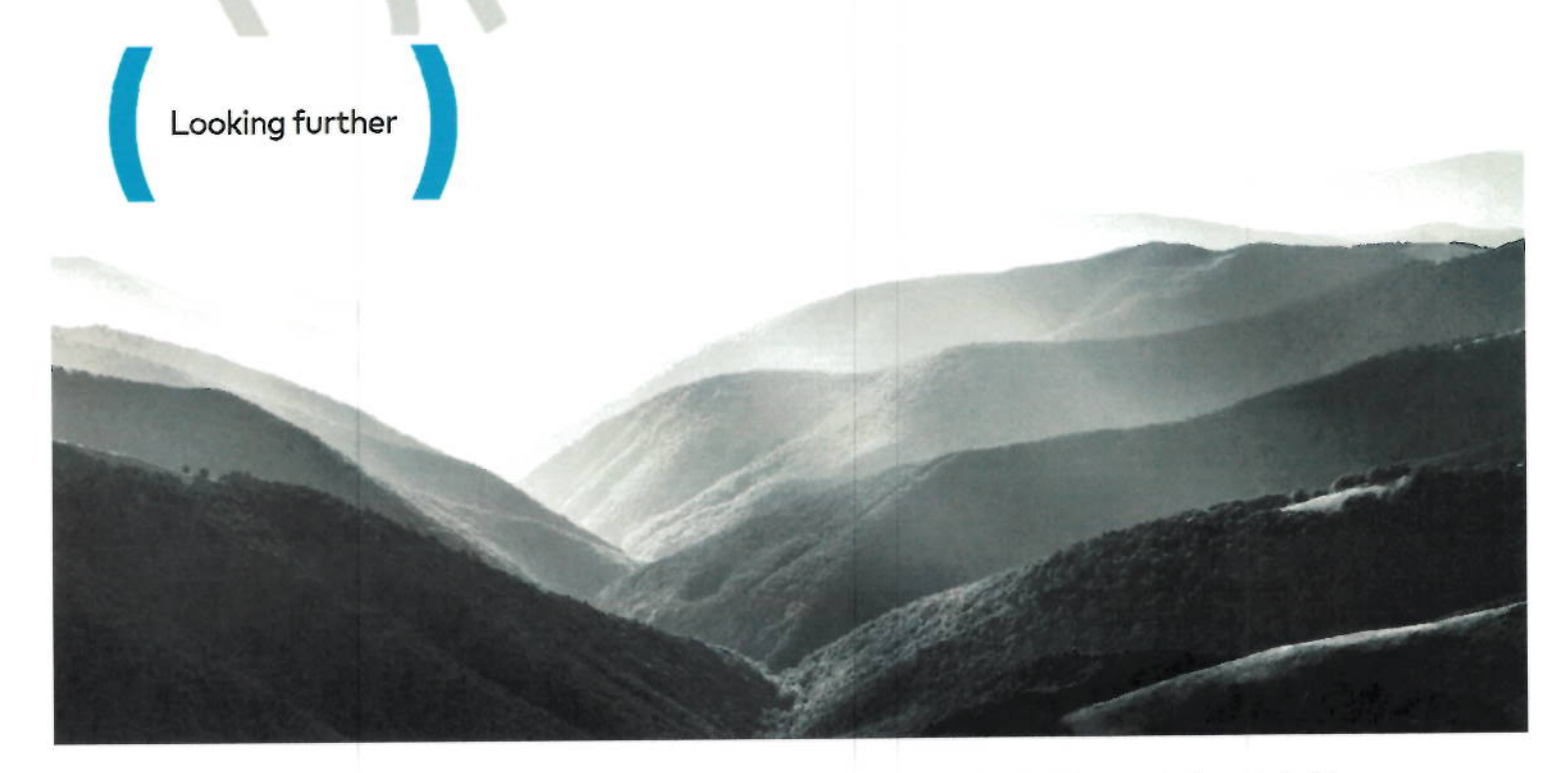
*** Confidential - Proposal is intended for Recipient and Recipient's Site Representatives Only ***